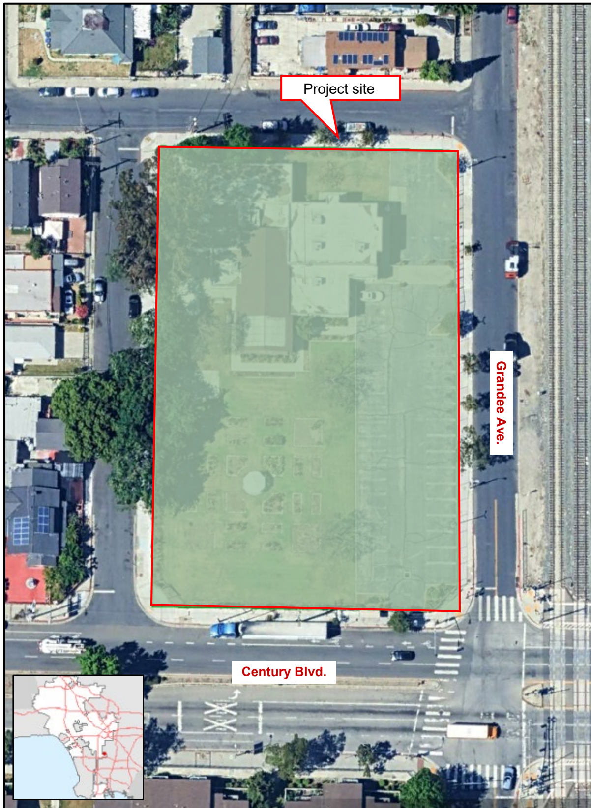
Figure 1. Project Location